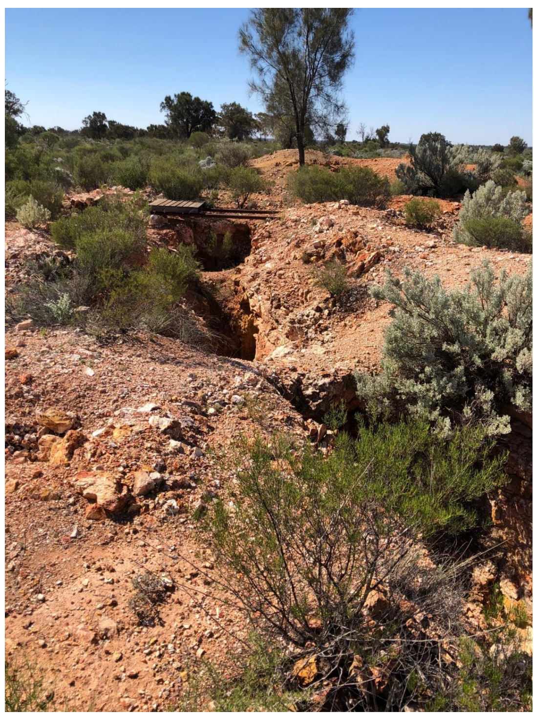
Plate 1. These are the old shafts at the Transville Mine on E25/526 that produced some 1,000 tonnes at nearly 1 ounce per tonne in the 1920s.