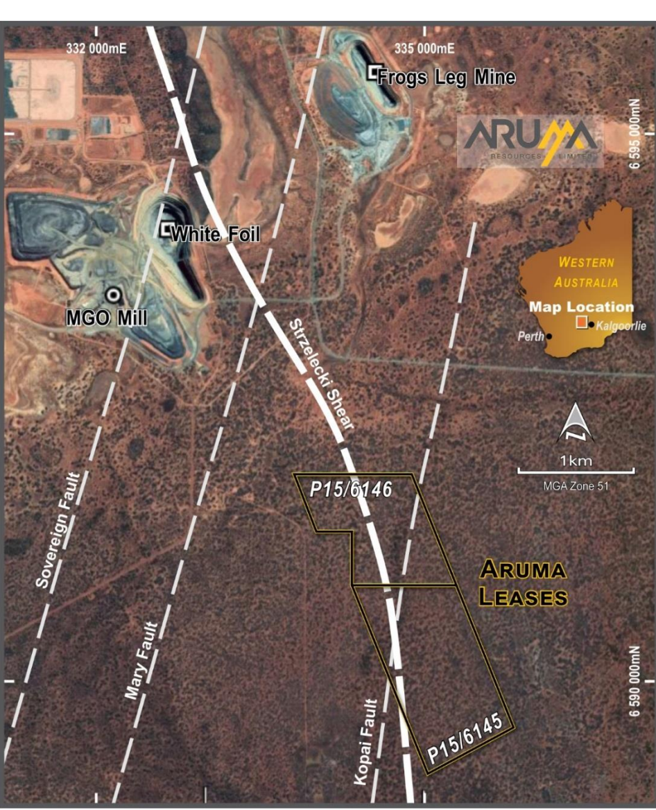
Figure 1. The location and surrounding mines at Kopai

The first phase of drilling is expected to be completed by early May, and results will be reported as they become available. A second phase drilling program is planned in the coming months, to follow up the results of the initial program.