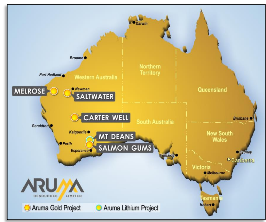
Figure 2: Aruma's project portfolio, showing the Mt Deans Project in south-east WA

A total of 11 rock chip samples were collected along a 500m strike (ASX announcement, 30 May 2022). This returned lithium of up to 1.96% Li<sub>2</sub>O and very high-grade rubidium of up to 1.42% Rb<sub>2</sub>O (rubidium oxide), plus caesium values up to 1,550ppm. Phase two drilling has targeted the pegmatite bodies across the 1500m strike length of the pegmatite swarm (Figure 1).