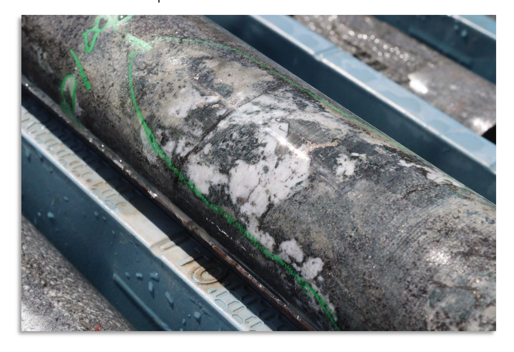
Figure 4. Drill core from SG23DD009 from 54.3m to 54.5m showing disseminated sulphide associated with the quartz lode mineralisation.