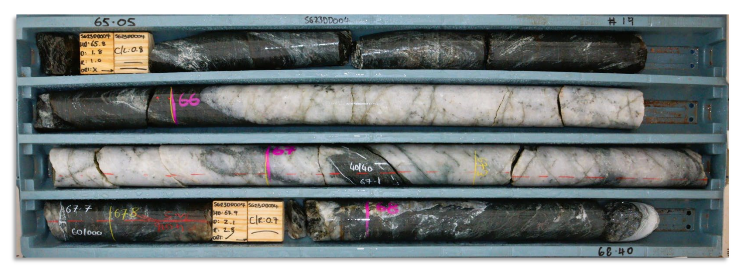
Figure 2. Drill core from SG23DD004 from 65.8m to 68.40m showing Norseman style quartz lode mineralisation with disseminated sulphide.