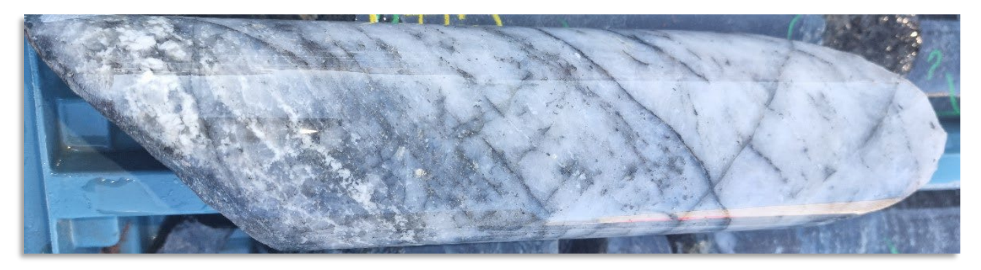
Figure 3. Drill core from SG23DD003 from 43.4m to 43.6m showing Norseman style quartz lode mineralisation with disseminated sulphide.