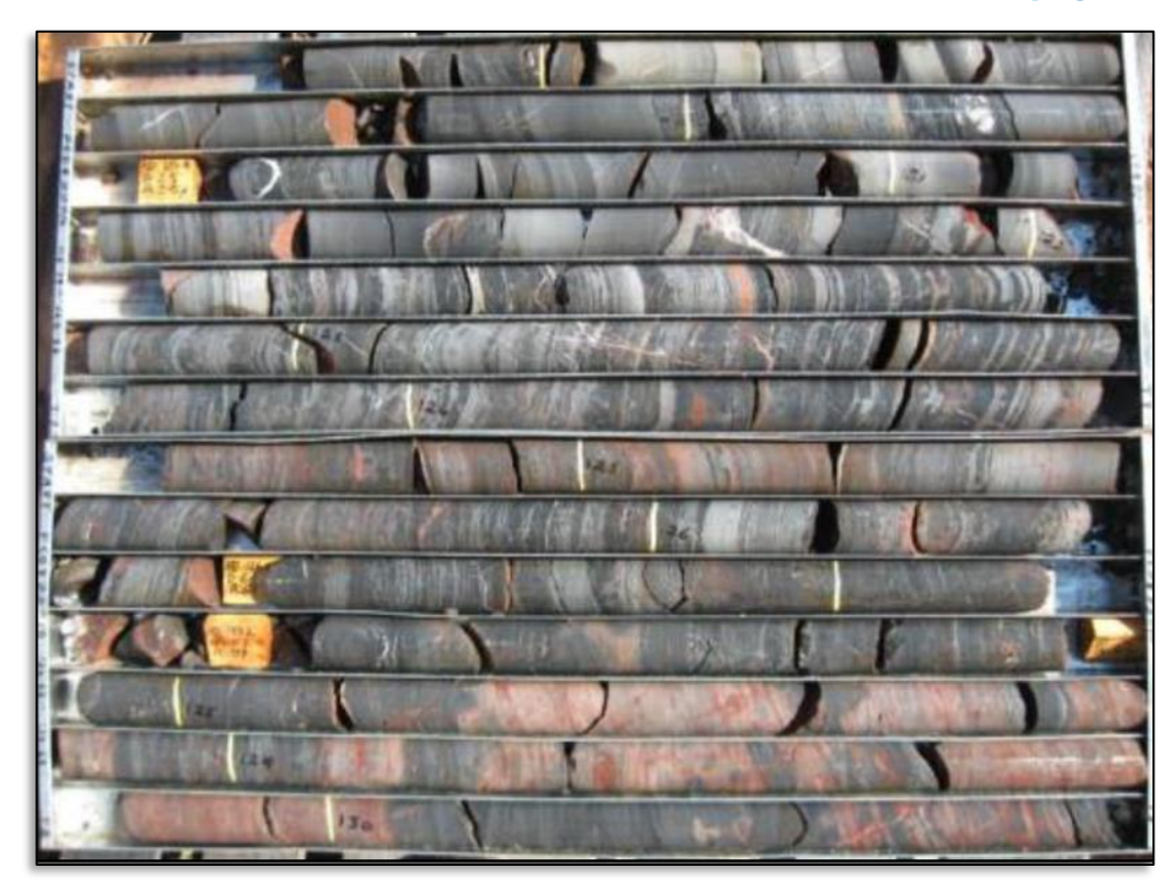
Figure 2: Red Rock (Hematite) Alteration in drill hole FC08DD010