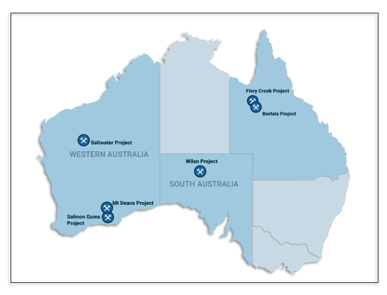
Figure 4: Aruma Resources project locations.

Aruma Resources Limited (ASX: AAJ) is an ASX-listed minerals exploration company focused on the exploration and development of a portfolio of prospective projects in high-demand commodities – copper and uranium - in world-class mineral belts, in South Australia and Queensland. It also holds gold, lithium and REE prospective projects in Western Australia