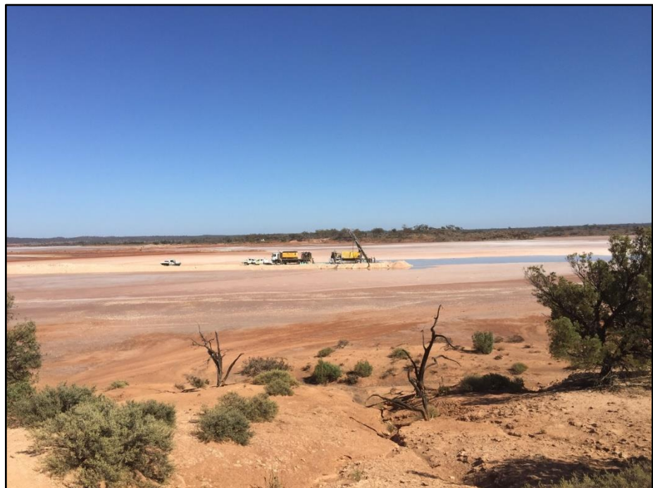
Figure 1. Drilling continues at Slate Dam,

Aruma Resources Limited is a West Australian focused gold exploration company, with advanced projects in the Kalgoorlie gold district. Aruma's leases, inclusive of applications, cover 750km 2 of which 30km 2 are under joint venture (Southern Gold Ltd) with the remainder wholly operated by Aruma.