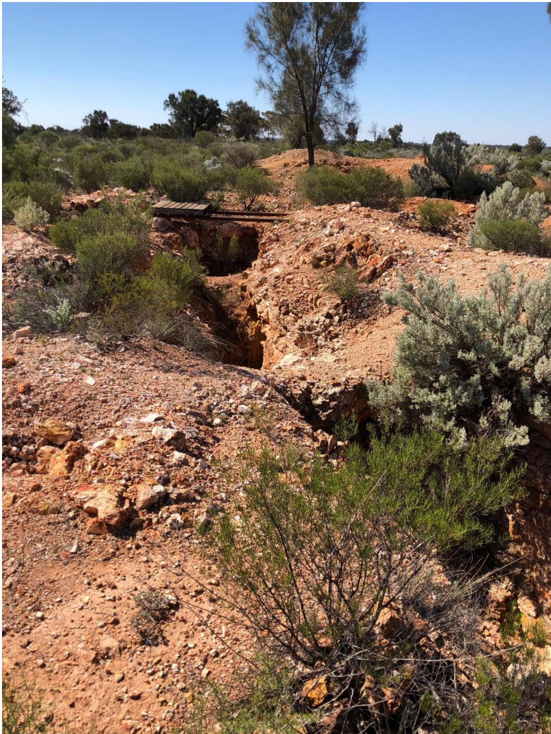
Plate 1. These are the old shafts at the Transville Mine on E25/526 that produced some 1,000 tonnes at nearly 1 ounce per tonne in the 1920s.